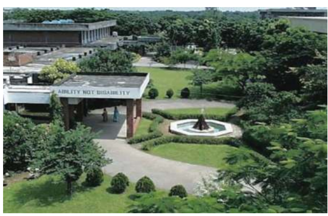
CRP- head office at Savar

CRP sub-centres across Bangladesh and the extensive range of high quality services now provided to persons with disabilities exemplify the progress made by CRP during its 36 years of operation.