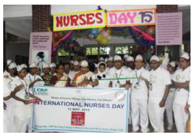
International Nurses Day observance by CRP-Nursing College students

During the last 4 years, 122 students passed the BNC licence examination and they are working successfully at renowned hospitals across Bangladesh.