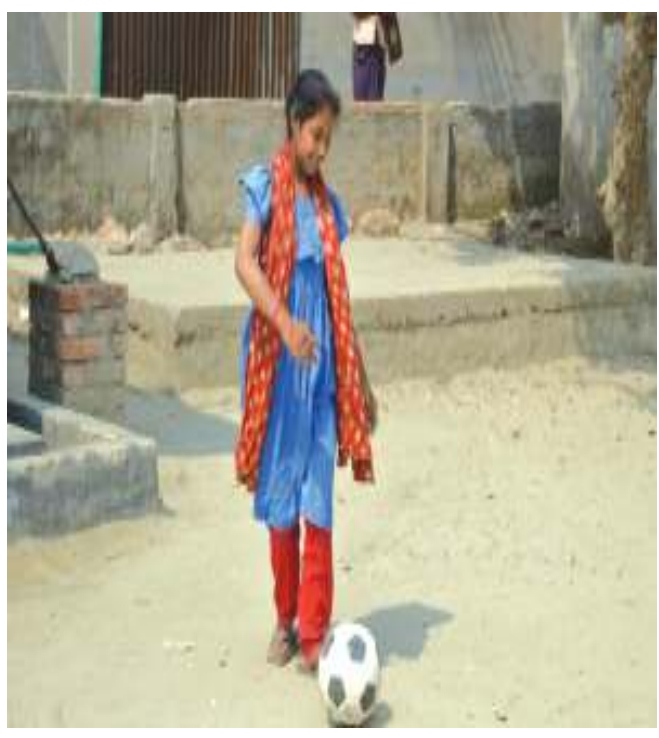
Sports activity at break time

identify the children with disabilities. The programme then commenced in the 15 targeted schools. About 500 children with disabilities were identified and referred to CRP Head Office and its divisional centres to receive treatment and rehabilitation services at low cost. This project also provided assistive device support to the child. with disabilities. Care giver education with referral and follow up of children with disabilities was conducted. Awareness and advocacv programmes with school teachers, sports mentors, peer supporters, DPOs, local representatives and parents also were carried out throughout the project duration to assist in the inclusion of children with disabilities in schools. In addition this project provided inclusive sports materials to schools and children in the community. School and community level inclusive sports were was also commenced.