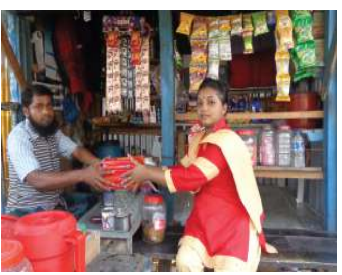
Providing economic support

Project Location: Dhaka, Manikgonj, Gazipur, Rajshahi, Barisal, Khulna, Moulavibazar and Chittagong districts.