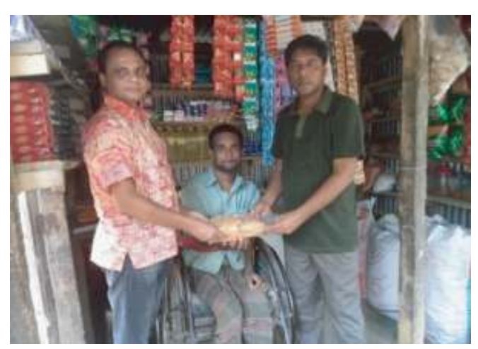
Items for sale added to the wheelchair user's shop as part of community reintegration support

CBR takes a holistic approach in working closely with persons with disabilities and their families to overcome physical and sociological barriers within their communities. Through CBR intervention, in close