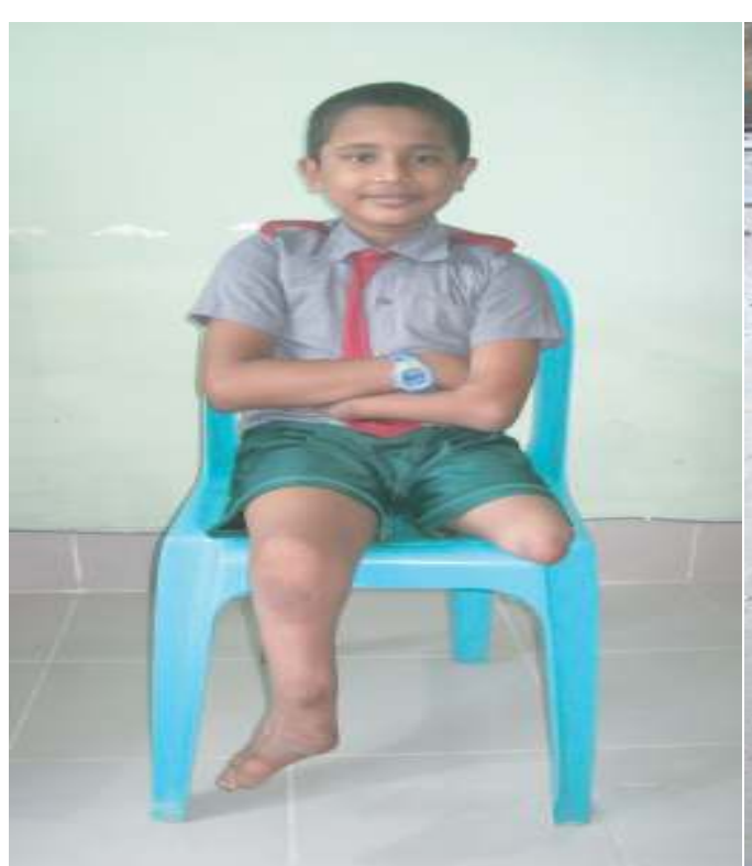
WMTS student before receiving prosthetic limbs

In this reporting year 1,403 orthotic devices and 103 Lower limbs, 35 Upper limbs and 33 prosthetic hands (LN4) have been delivered. The LN4 hands have been donated free of cost by an organisation in the USA and are channeled through Rotary Clubs around the world. We also organised a mobile clinic for fitting of LN4 hands at CRP-Mirpur with the collaboration of the Rotary Club of Dhaka.