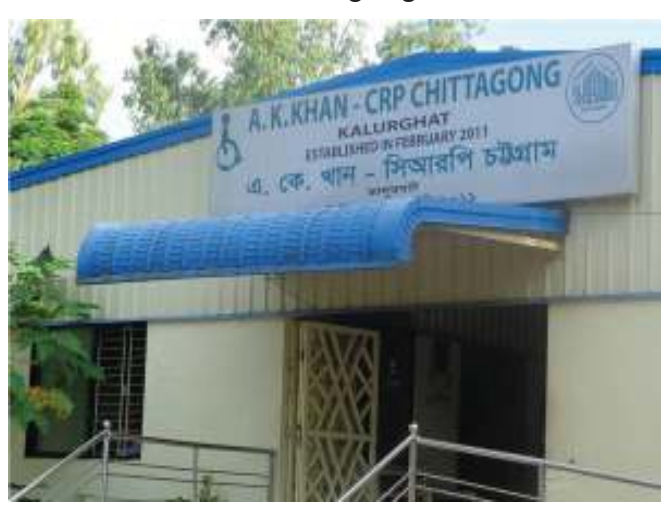
A.K. Khan-CRP, Chittagong

A. K. Khan-CRP Chittagong is a divisional centre of CRP which is gradually becoming known in the rehabilitation field across Chittagong division since its inauguration on 2nd October, 2012. Health professionals are providing services following the same practice as CRP-Savar and they play a significant role in the treatment and rehabilitation of people with disabilities in Chittagong.