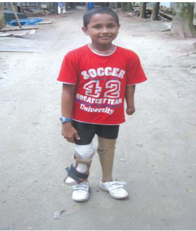
WMTS student with new prosthetic limbs