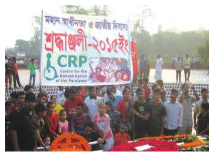
CRP's inpatients observing Independence Day

have completed their primary education have been reintegrated by this system. This department also organizes an inter Disciplinary Team (IDT) visit at CRP-Ganakbari fortnightly.