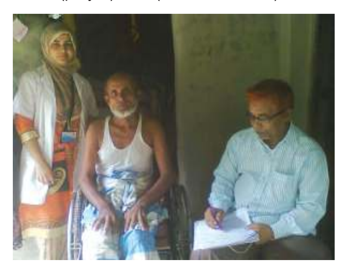
Ex patient follow-up by CRP's Social Worker

SWD is responsible for patient assessment based on socio-economic status, educational background and the surrounding environment and it provides support as required. The department also arranges the collection of treatment blood for the of patient emergencies. The ultra-poor patient receives subsidised treatment, surgical operations, mobility aids, assistive devices and capacity building training. SWD facilitates emergency transfers, manages referrals, picnics for inpatients, recreational programmes, Milad-Mahfil (prayer), Iftar (to break the fast).