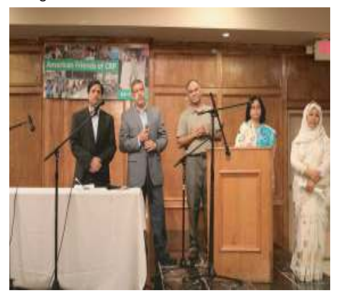
AFCRP Executive Committee Members delivering speech at the Houston fund raising dinner in March

American Friends of CRP (AFCRP) with the intention to help poor disabled people of Bangladesh.