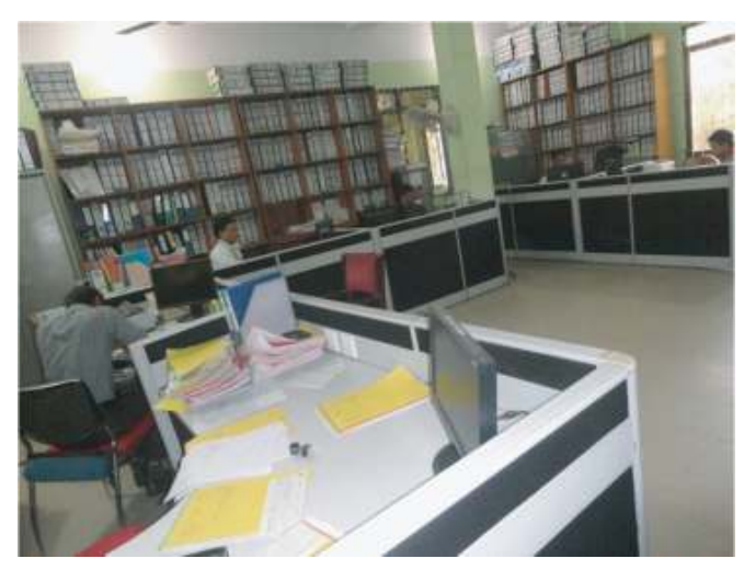
Office furniture donated by Woolworths Global Sourcing in CRP's Accounts Department

The financial statements of CRP are prepared on "a going concern basis" under the historical cost convention using the accrual system of accounting in accordance with the International Accounting Standards (IAS) and International Financial Reporting Standards (IFRS) as adopted in Bangladesh. However, sometimes the project financial statements are prepared in accordance with Donor and auidelines NGO Affairs Bureau requirements. The accounting year of CRP and all its sub centres is from July to June. Both the Annual Budget and Financial Statements are prepared according to the accounting year. However, the mutual project financial year varies according to the project agreement.