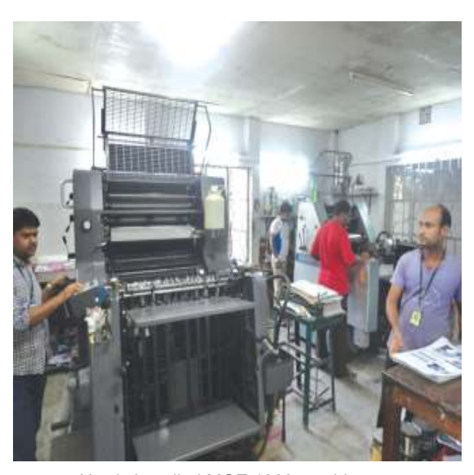
Newly installed MOE 1993 machine at CRP Printing Press

The goal of the printing press unit is the production and supply of quality items as per the internal and external demand.