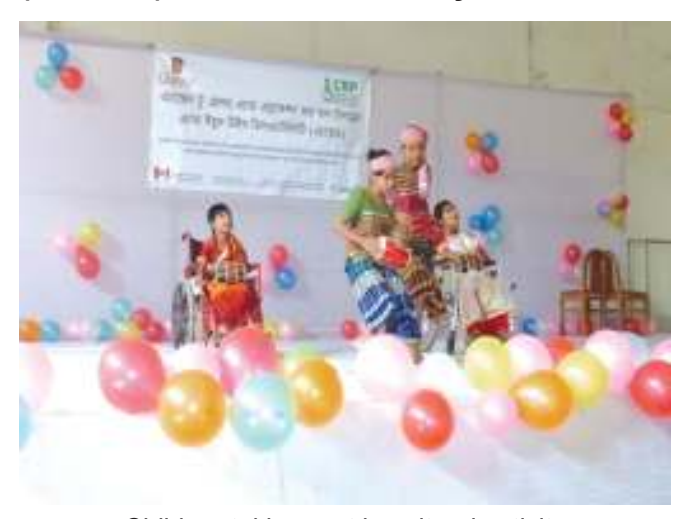
Children taking part in cultural activity

CRP partnership with the International Centre for the Advancement of Community Based Rehabilitation (ICACBR), Queen's University, Canada