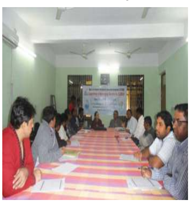
Annual General Meeting of SCIDAB

The Spinal Cord Injuries Development Association Bangladesh (SCIDAB) emerged in 2011 following the decision of a concerned group of persons with SCI in Bangladesh to come together for a common purpose with the active cooperation of the CRP. SCIDAB which is a Disabled People's Organisation (DPO) has now been transformed into a national association of people with SCI and is working to improve equal rights, opportunities and participation for people with SCI and reduction of further SCI in Bangladesh.