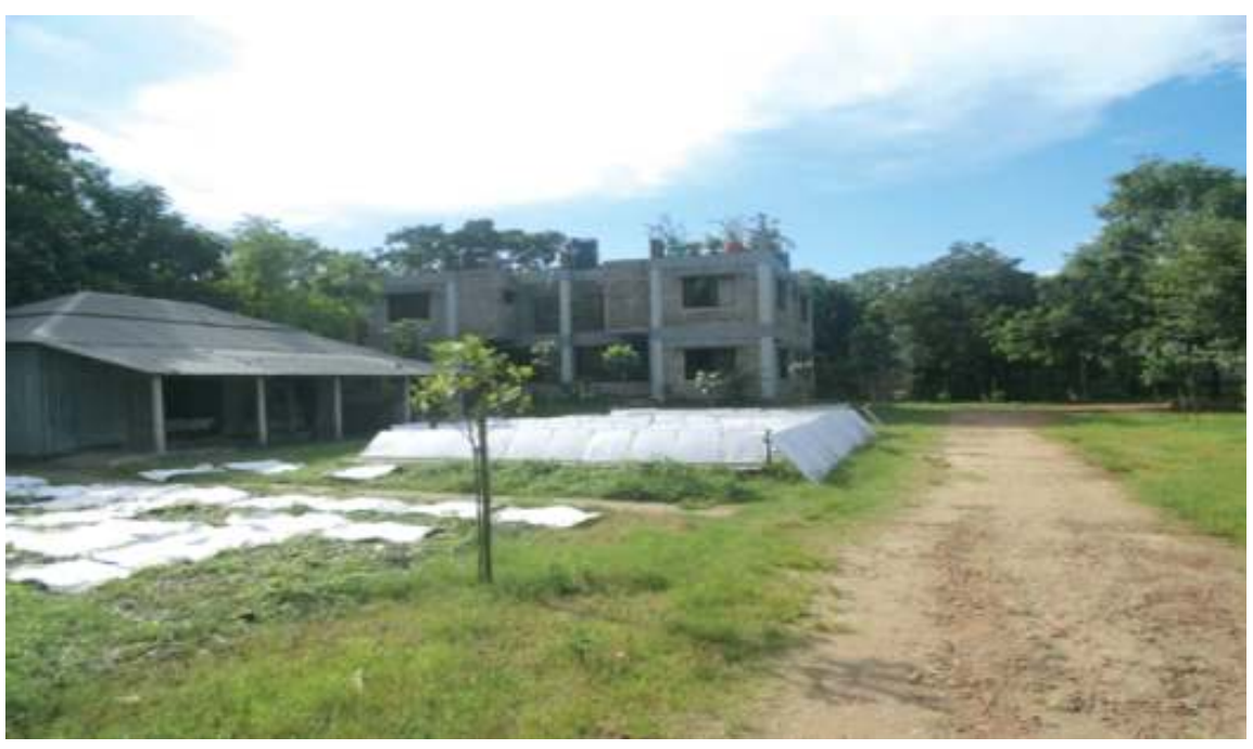
Recycled paper out to dry at CRP-Ganakbari

A 12,000 square feet workshop has been established with the support of the Kadoorie Charitable Foundation, Hong Kong. The metal workshop, wood workshop and special seating units are operating here. Recycled paper technology and the printing press are running at this centre and are fulfilling the internal printing demand of CRP. Other income generating activities include lease of the ponds, 18 shop rents and a plant nursery.