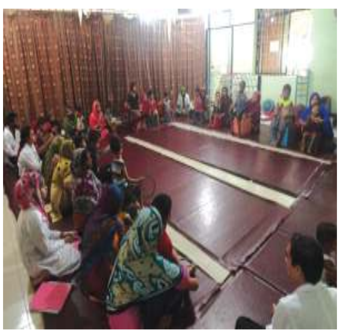
Paediatric combined therapy session

Individual physiotherapy and occupational therapy appointments are arranged for outpatients. During this reporting period the total number of outpatients were 2,820 (23,764 appointments) and 742 inpatients included in the 14 days programme.