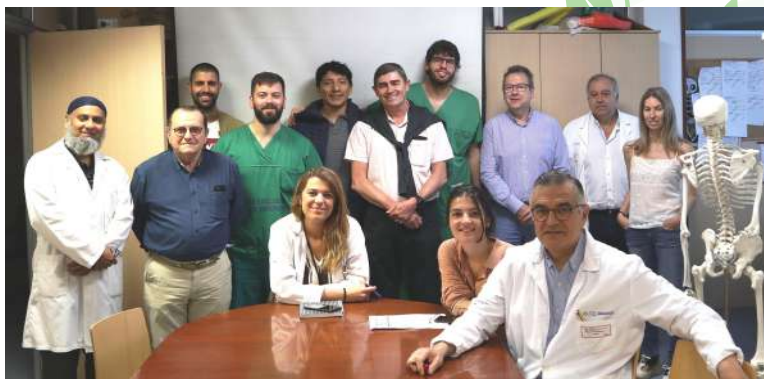
Spine and Orthopedic Surgeons, CHUAC