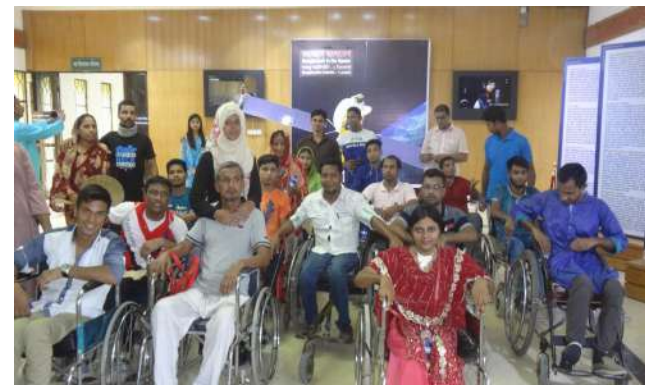
Eid outing at Novo Theatre, Dhaka