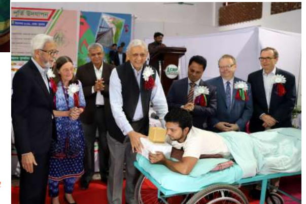
Dr. Gowher Rizvi handing over prize to a patient of CRP after sports competition