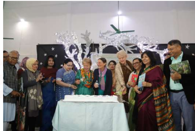
All guests cutting the birthday cake after book launch

All guests along with CRP's special needs children and students from Scholastica and South Breeze Schools visited the book stalls and also enjoyed a friendly women's wheelchair basketball match at the basketball ground. The two schools cheered two different teams and handed over the prize money to the winning team and the runners up team which the students raised themselves. Later the guests inaugurated the Rotary International projects together and visited the facilities.