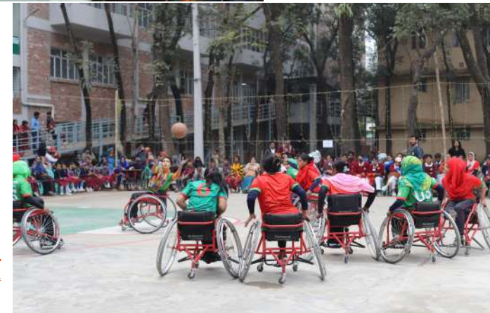
Friendly women's wheelchair basketball tournament