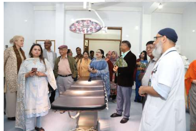
Guests visiting the newly equipped operation theatre