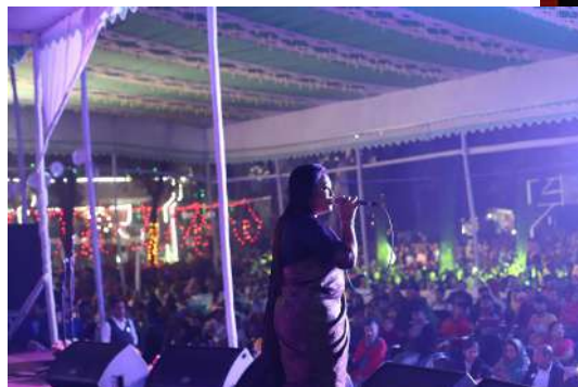
Famous Folk Singer and MP Momtaz Begum performing on 11th December