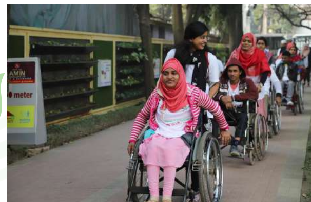
CRP's patients, volunteers, staff, students and donors in the Annual Sponsored Walk at Gulshan-2 Lake Park