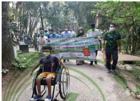
Rally to celebrate OT Day

The Occupational Therapy Department of CRP observed the International Occupational Therapy Day 2020 with the theme “Reimagine doing” on 27th October 2020. The professionals arranged different events to make people aware of the occupational therapy services, its need and benefits.