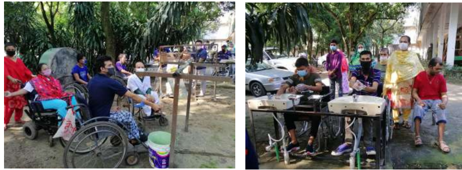
Patients washing hands