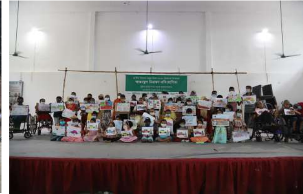
Wheelchair Basketball Tournament & Art Competition to observe Road Safety Day