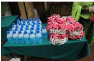
Dry food packages and hygiene kits