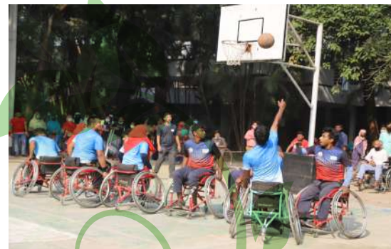
Wheelchair basketball friendly match