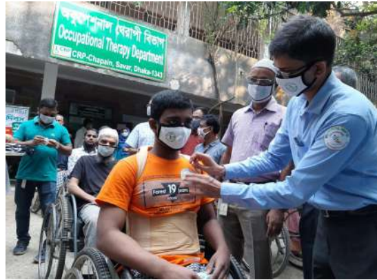
Mask distribution to the patients