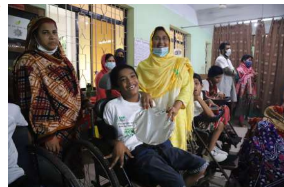
Prize giving on CP Day