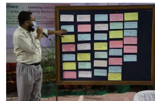
RRED Project Coordinator presenting group works