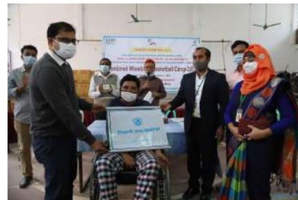
Social Welfare Officer of Savar Upazila handing over a wheelchair by MATW fund

Muslims Around the World, Australia has donated ten thousand Australian dollar to CRP for supporting the under privileged persons with disabilities. A total of 96 beneficiaries received wheelchairs and other assistive devices through the Social Welfare Department of CRP.