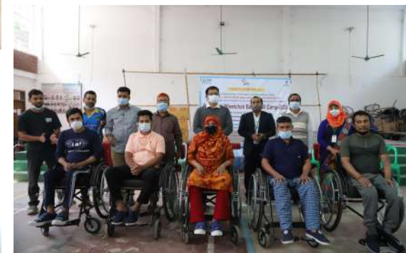
Patients receiving wheelchairs