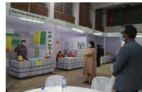
DPO's presenting their activities to the guests