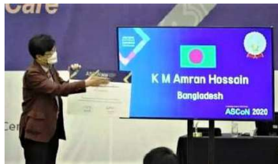
Award Giving of the conference