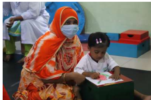
A child participating in art competition