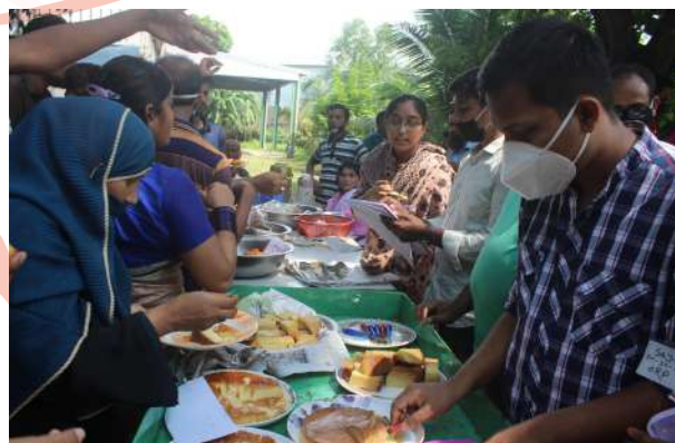
Patients selling foods to the staff