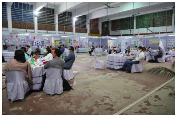
Guests and participants at the Reddaway Hall

The Rights, Rehabilitation, Empowerment for person with Disabilities (RRED) project of CRP has been coming to an end of its 3 years and 10 months journey on 31st December 2020. The project has been implemented by CRP in partnership with the Christoffel Blindenmission (CBM) and co-funded by the Federal Ministry for Economic Cooperation & Development (BMZ). During the project period 30,655 persons with disabilities residing in the project areas received treatment, rehabilitation and income generation support through three divisional centres of CRP (CRP-Rajshahi, Afsar Hussain Centre, CRP-Chattogram, A. K. Khan Centre and CRP-Sylhet, Iskandar Shitara Centre).