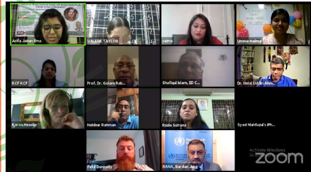
Guests speaking at the webinar