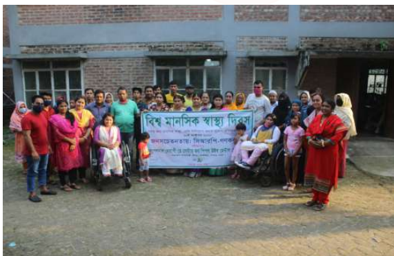
Patients and staff of Mental Health Day Centre