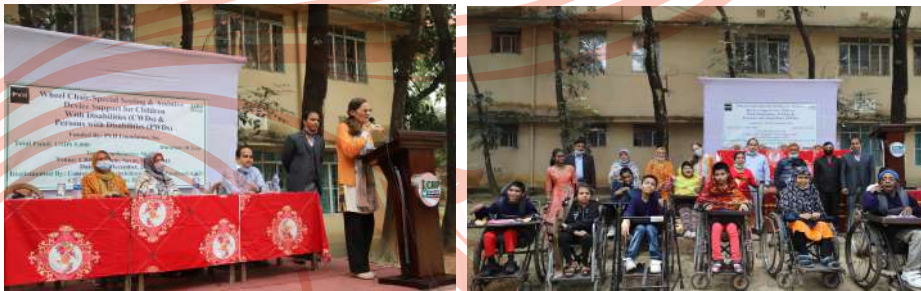
Assistive Device handover programme by PVH